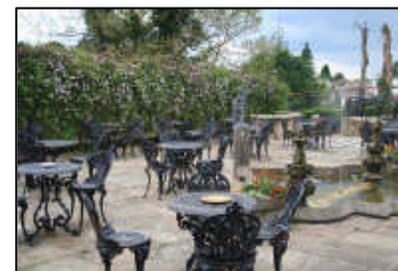
The Formal Garden at Mullaghmore House