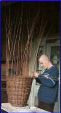
Willow Basket Making